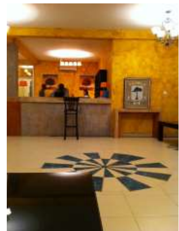
Hotel Banapa Club equipado por Africa Supply®