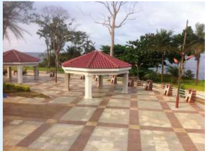
Material of Africa Supply in Sipopo